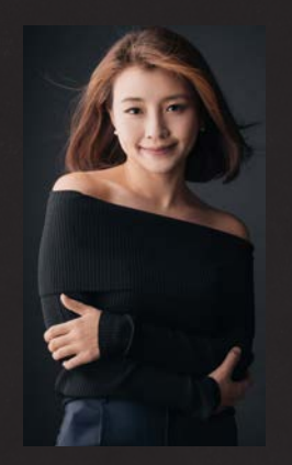
CHERRY AU FOUNDER | PRINCIPAL ARTIST

STEP INTO A WORLD OF GLAMOUR AND SELF-EXPRESSION WITH OUR TEAM OF PROFESSIONAL MAKEUP ARTISTS AT AUTELIER PRO. WE'RE NOT JUST CREATORS OF BEAUTY; WE'RE CURATORS OF STYLE, STAYING ON THE PULSE OF THE LATEST TRENDS WHILE INFUSING EVERY LOOK WITH A PERSONAL TOUCH.